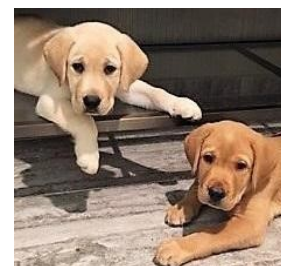
Mickey and Doug